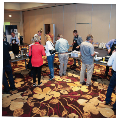
Members enjoy fresh gourmet pancakes prepared by the BC Road Builders' board of directors at the Construction Leaders Breakfast.