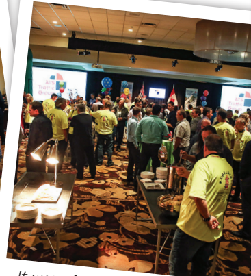
It was a full house at this year's Service and Supply Sector hosted Carnival Kick-off Night!