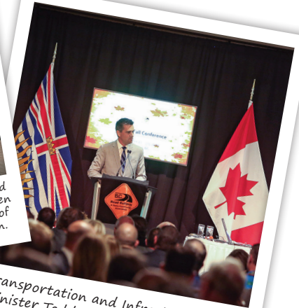
Transportation and Infrastructure Minister Todd Stone addresses attendees at the Fall Banquet Dinner