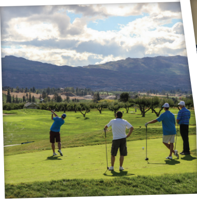
Great day for golf at the BC Road Builders/MOTI Worm Burners Invitational Golf Tournament.