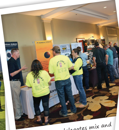
Fall Conference delegates mix and mingle at the tradeshow exhibits.