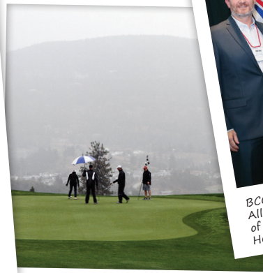
Golfers braved the rain at this year's Road Builders Fall Classic Golf Tournament.