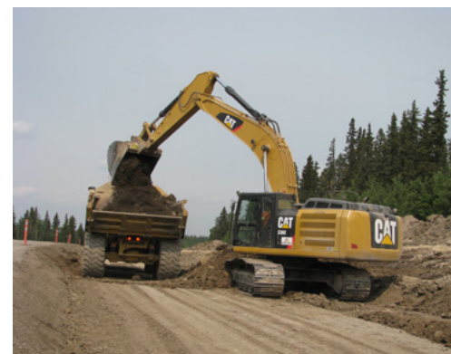
Alaska Highway No. 97 Mile 63 Passing Lane