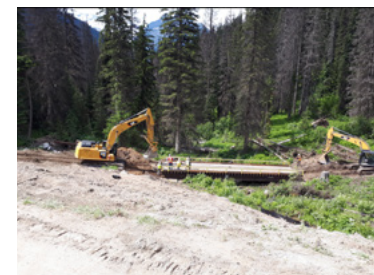
Illecillewaet Curve Safety Improvements