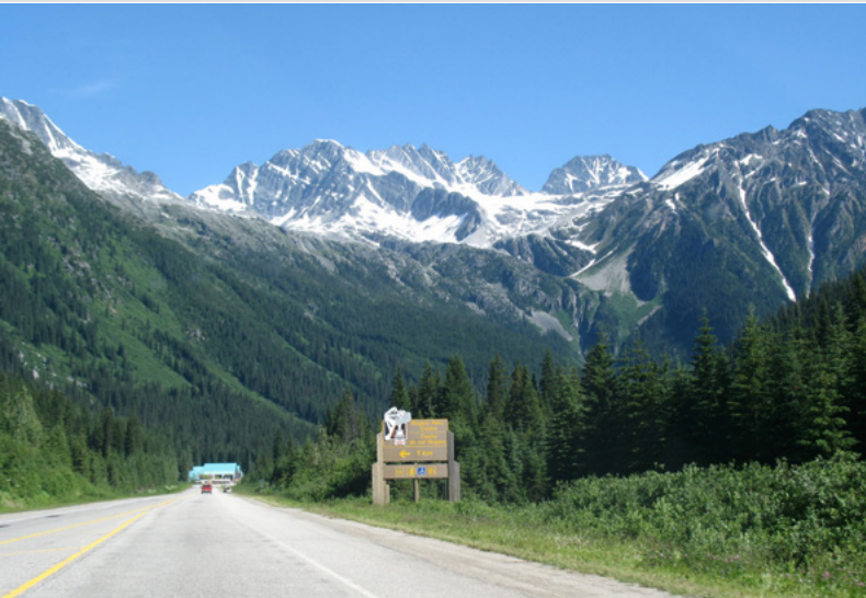
The Trans-Canada near Revelstoke