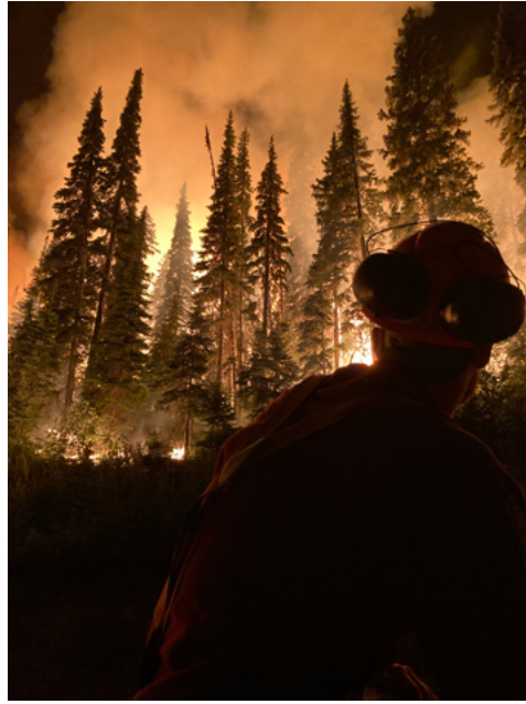
Emcon Services supporting firefighters and emergency services in Merritt, BC in August 2021.