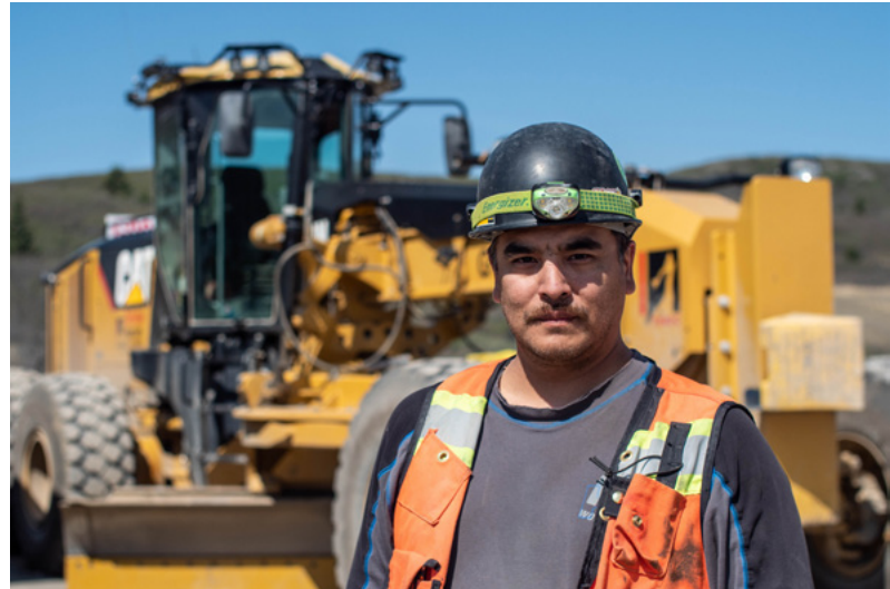
Worker at Tahltan Nation Development Corporation, Dease Lake

Although reconciliation is the responsibility of all, and BCRB&HCA are leaders in Indigenous engagement, the committee advocates that our government show increased leadership and provide clarity and fairness for all nations and contractors alike.