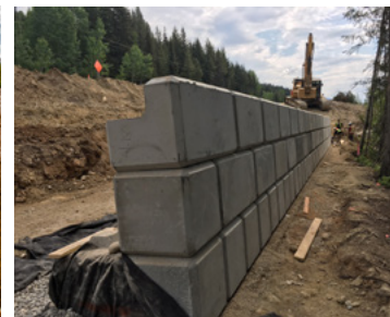
Hwy 1: Donald to Forde Station Lining