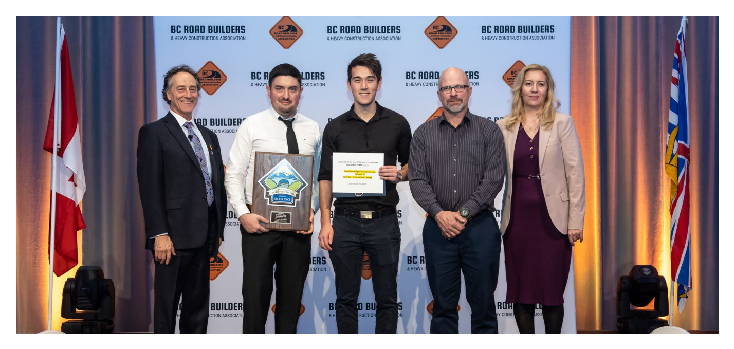
BRIDGES & STRUCTURES AWARD: COQUITLAM RIDGE CONSTRUCTORS LTD.