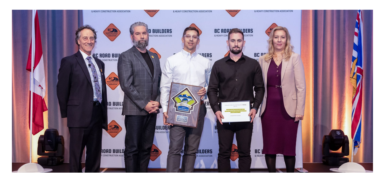
PAVING AWARD: EMIL ANDERSON CONSTRUCTION